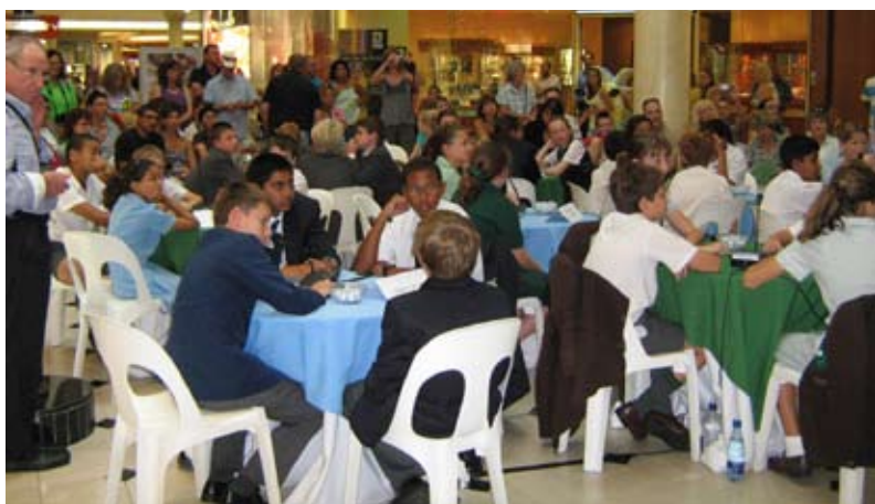
The SA Kids' Lit Quiz finals at Exclusive Books, Tygervalley