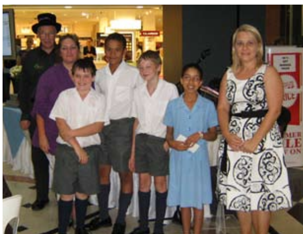
The Grove team came second at the SA finals